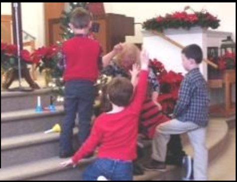
Family Night Out—"Festival of Trees"